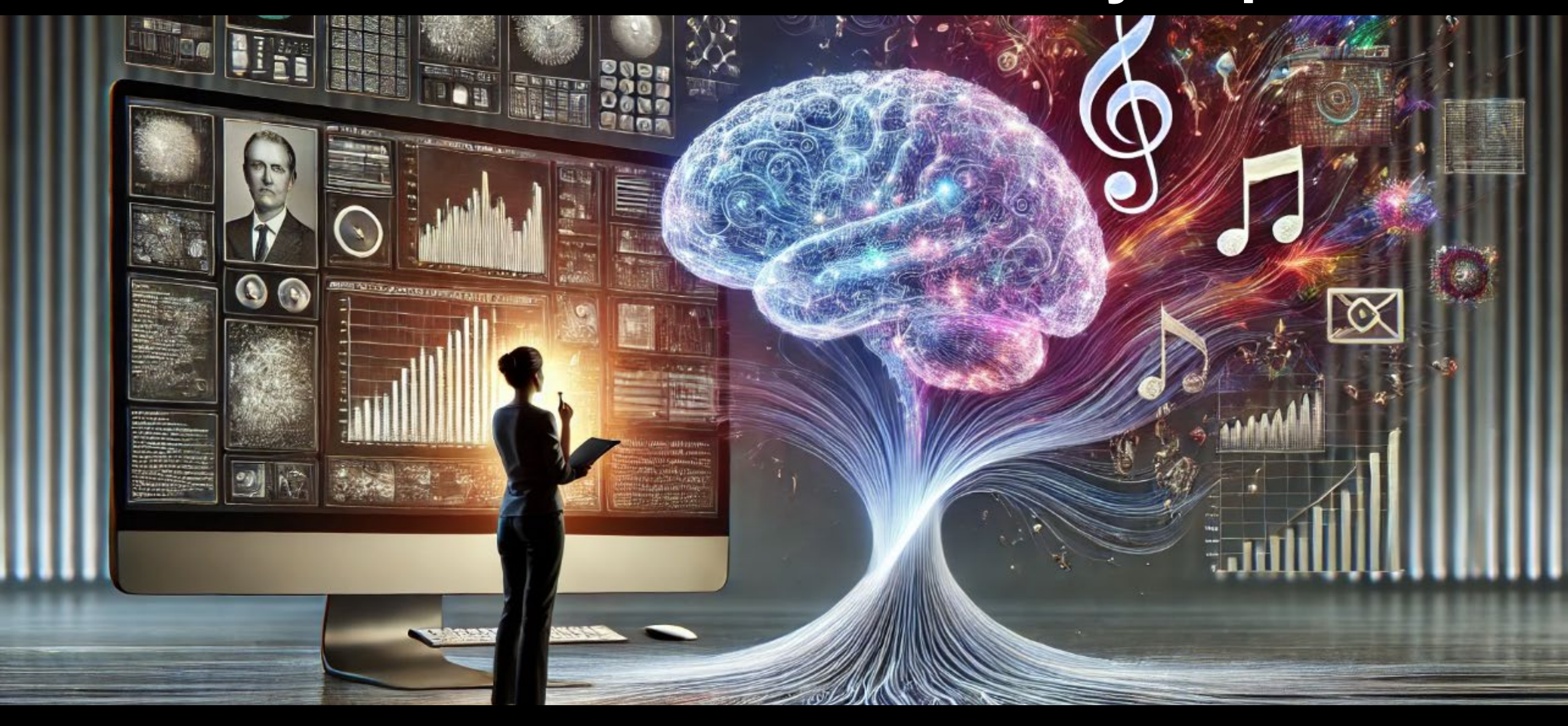
...And Blowing (Some of) Our Minds